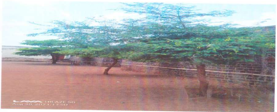
Eco Friendly Campus