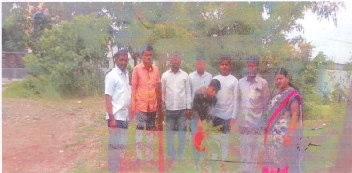
Tree plantation by staff.