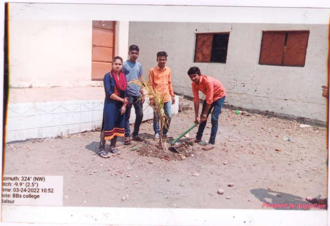
Student Tree plantation

Azimuth: 324° (NW) Pitch: -9.9° (2.5°) Time: 03-24-2022 10:52 Note: BBS college Balsur