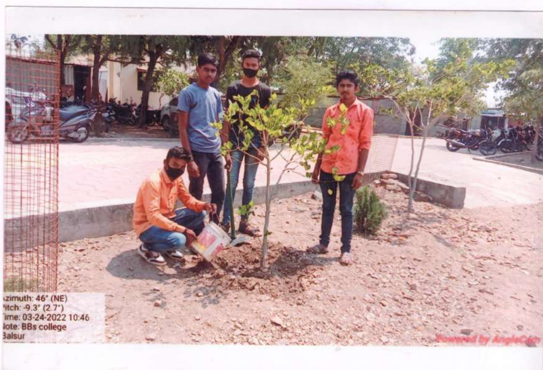
plantation by Students PRINCIPAL Bhauasaheb Birajdar Sr. College Balsoor Tq. Omerga Dist. Osmanabad