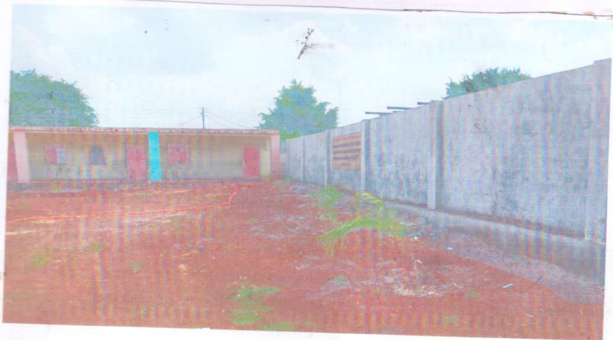
plantation in campus.