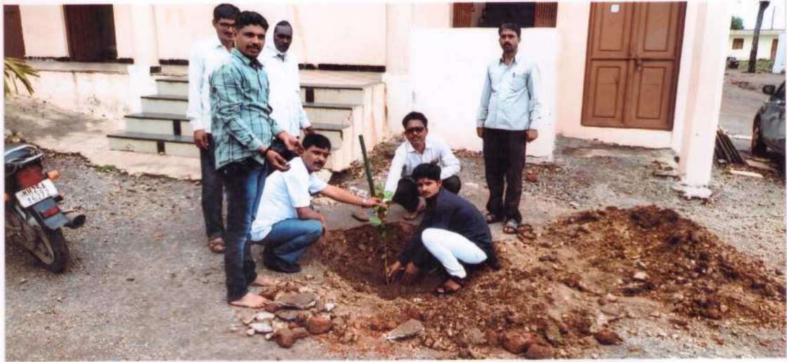
Tree plantation by staff.