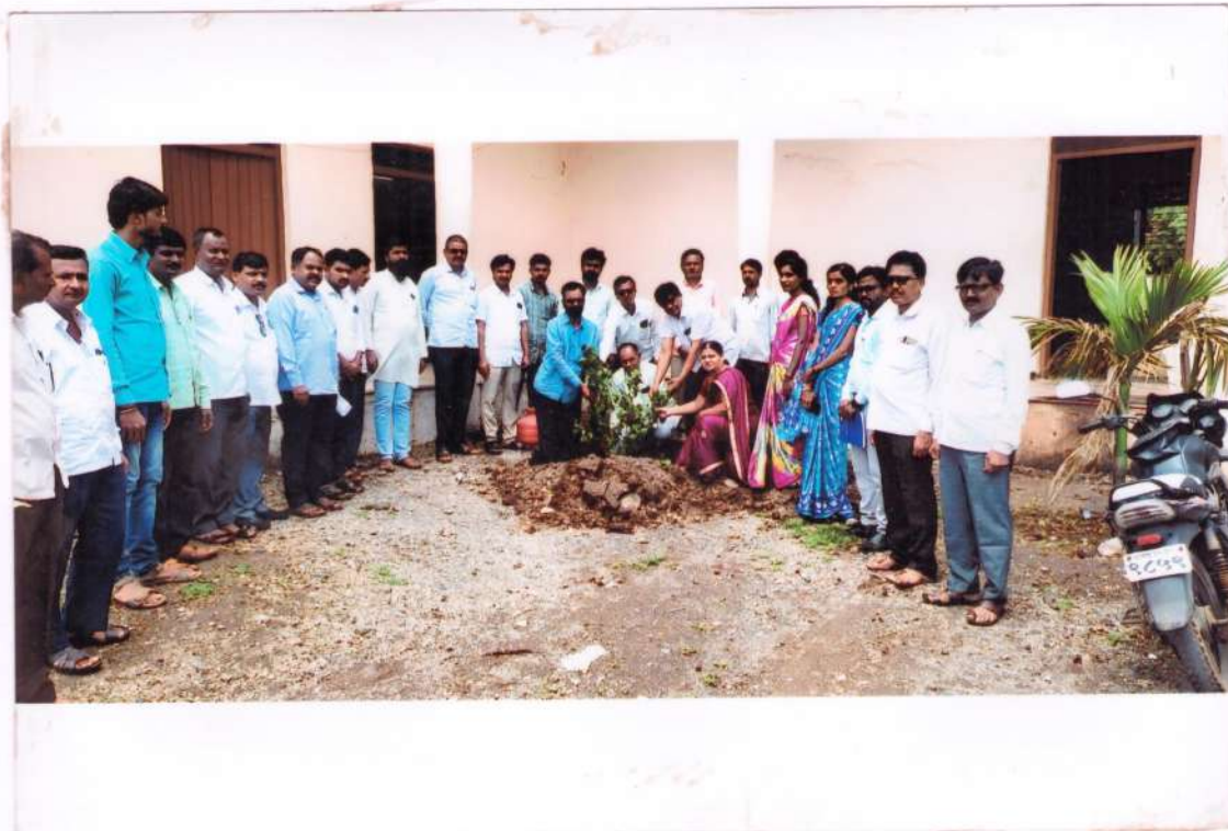
plantation by staff