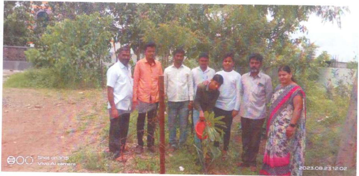
Tree plantation by staff & student