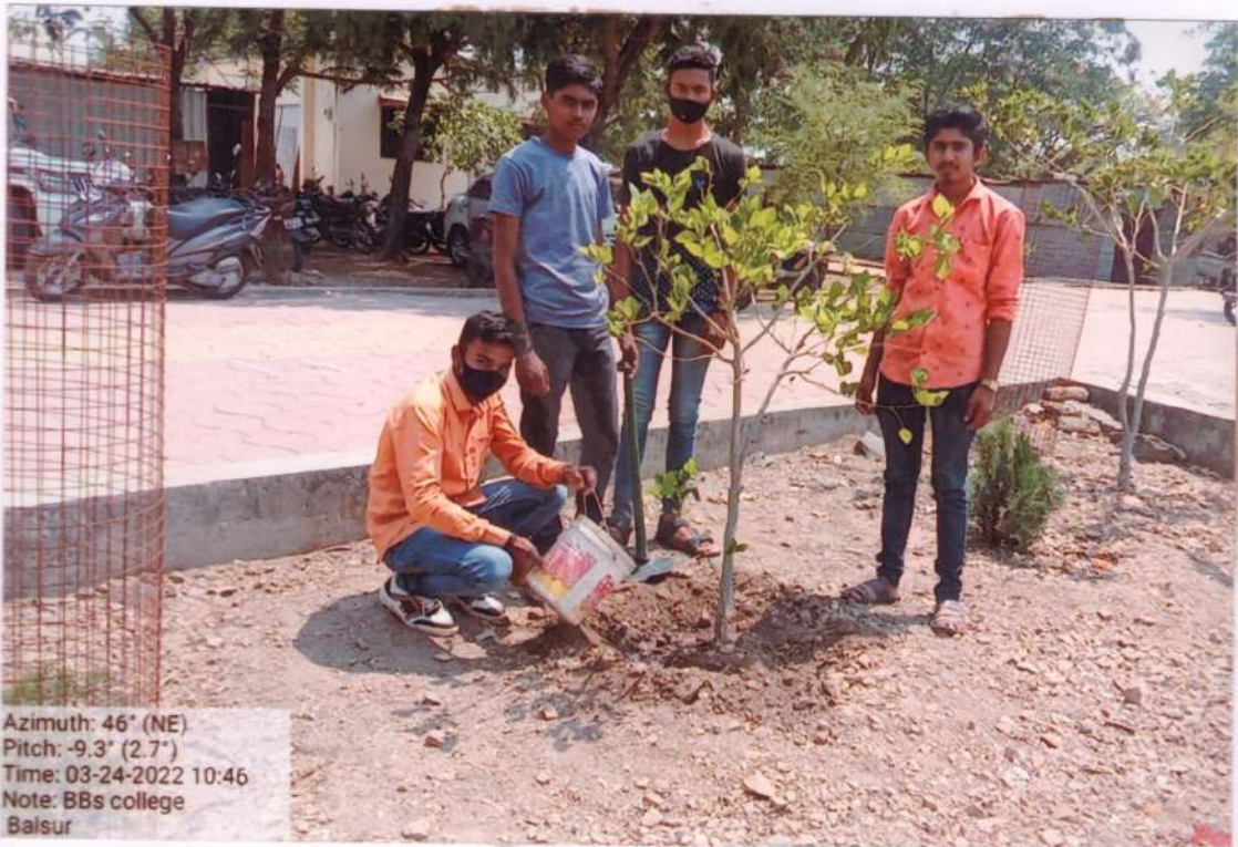
Tree plantation by student