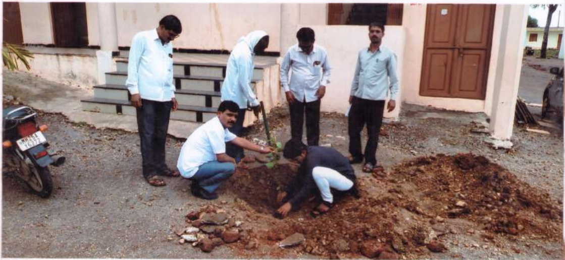
Tree plantation by staff