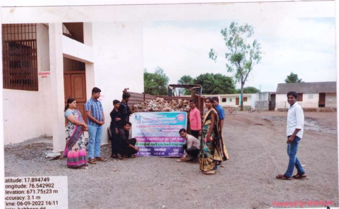
Collect plastic by staff & student